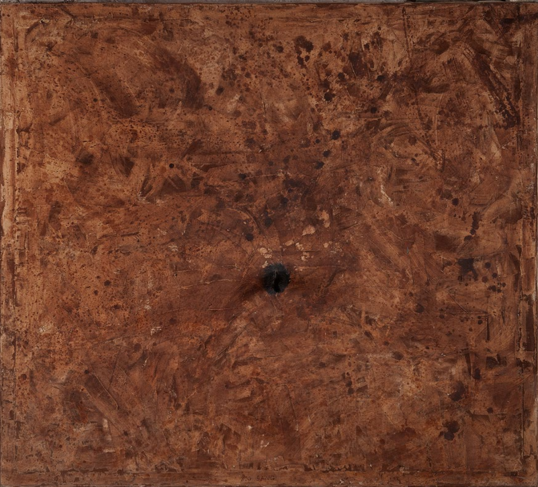
BIG-BANG/PANKÁČ V BAŽINE, 1988 ASAMBLÁŽ, AKRYL, PLÁTNO 145X162 CM, MAJETOK AUTORA