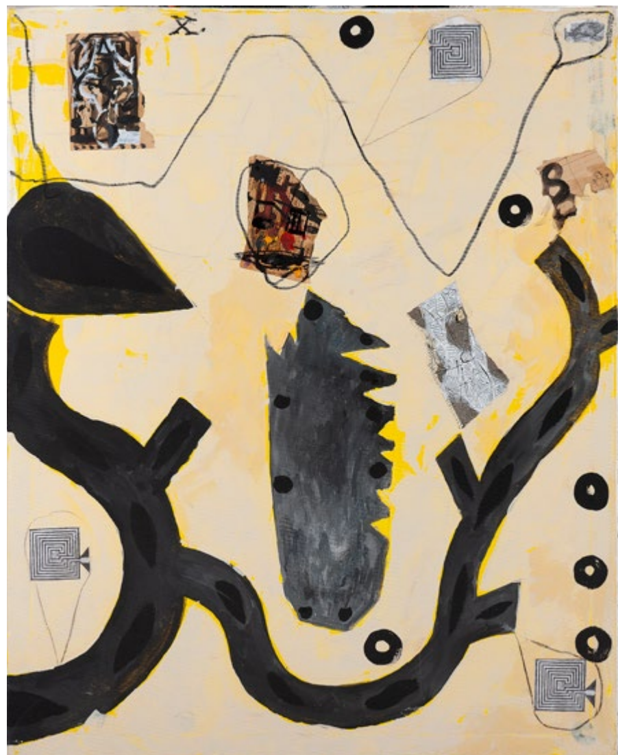
FRAGMENTY A LABYRINTY, 2017, AKRYL, OLEJ, KOLÁŽ, PLÁTNO, 100X80 CM. MAJETOK AUTORA FRAGMENTS AND LABYRINTHS, 2017, ACRYLIC, OIL, COLLAGE, CANVAS, 100X80 CM. COURTESY OF THE ARTIST