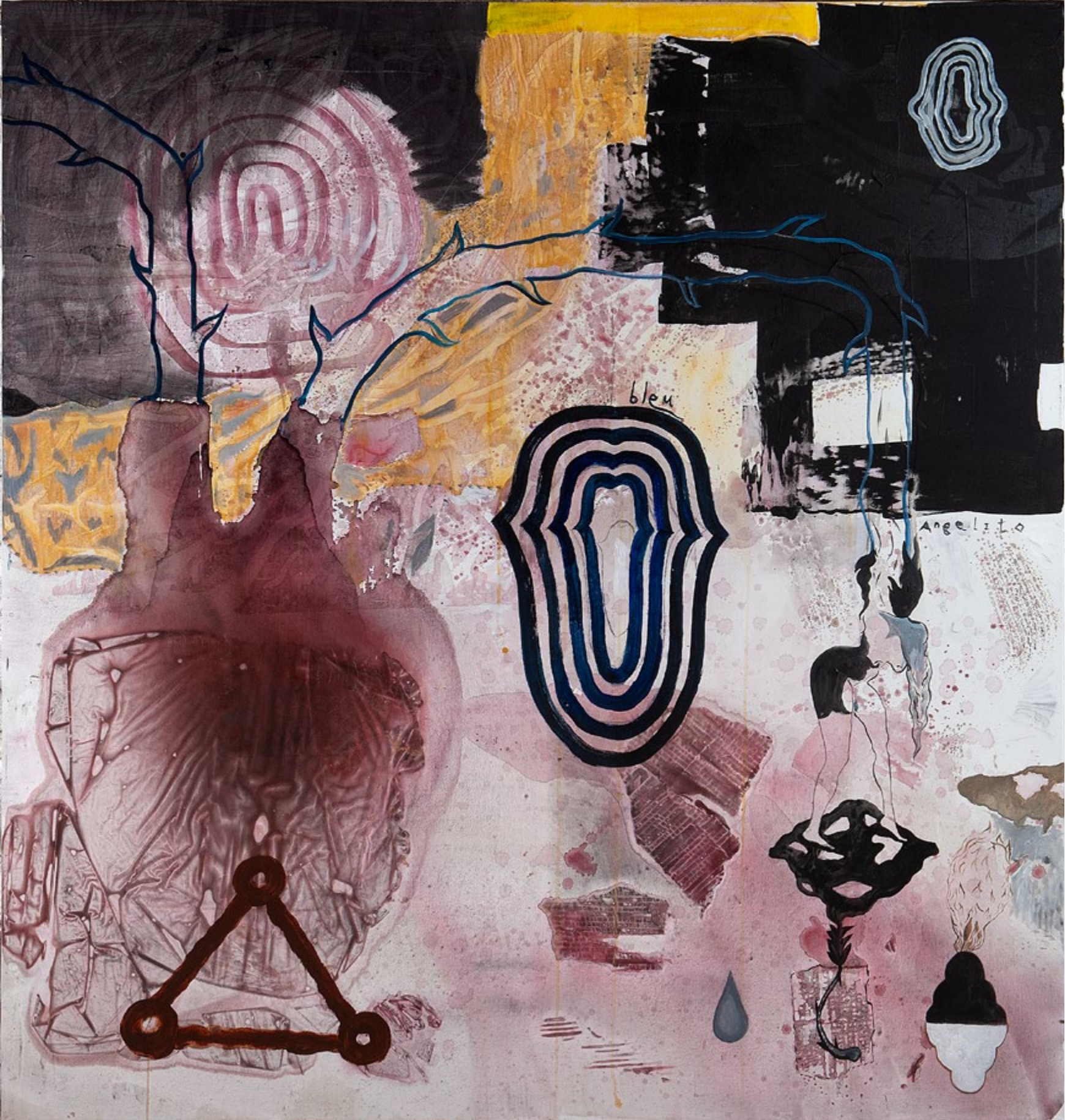
SRDCE, 2004, AKRYL, OLEJ, PLÁTNO, 160X150 CM. MAJETOK AUTORA HEART, 2004, ACRYLIC, OIL, CANVAS, 160X150 CM. COURTESY OF THE ARTIST