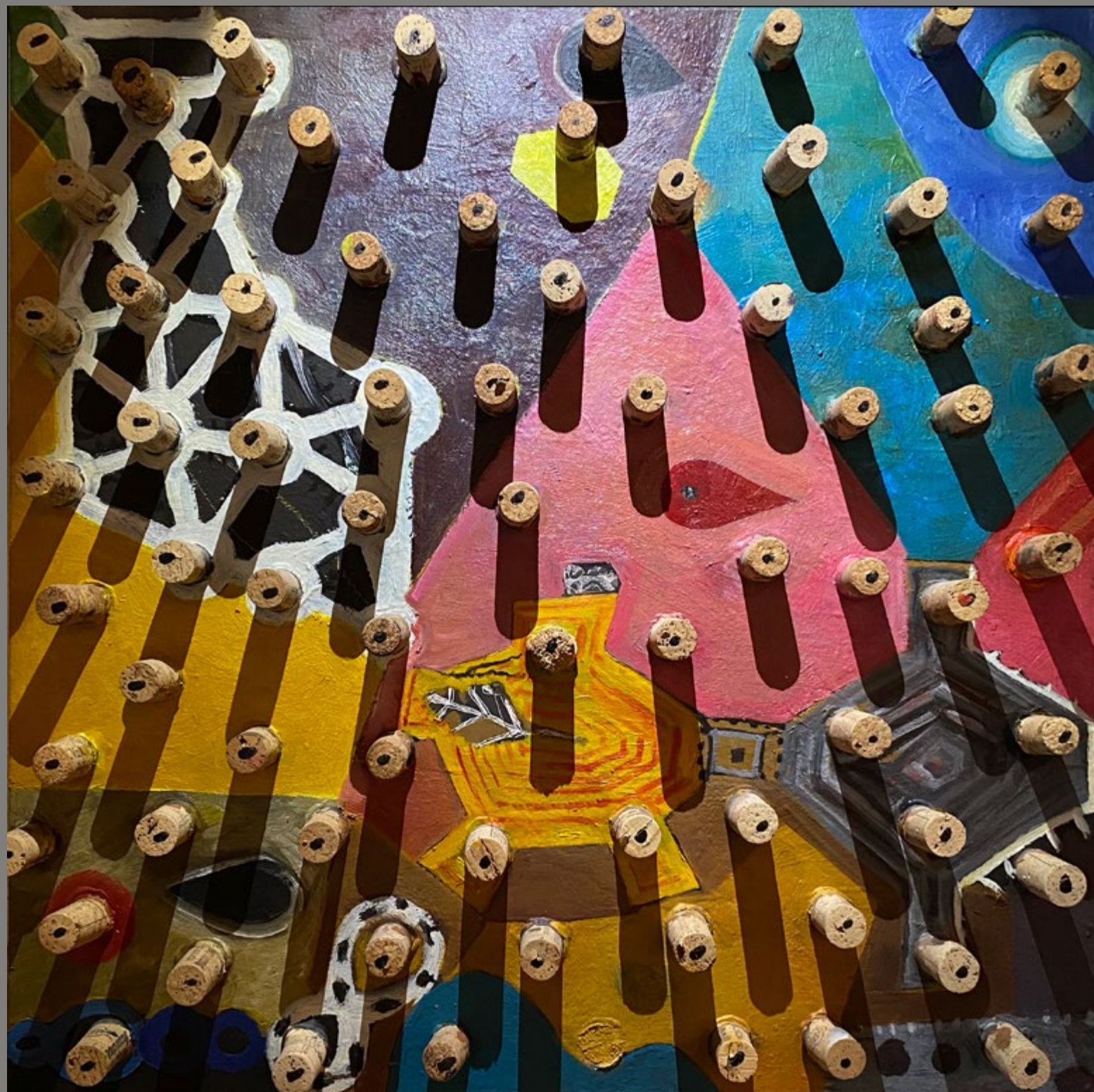
NO MAMES, 2017, AKRYL, OLEJ, ASAMBLÁŽ, PLÁTNO, 80X80 CM, MAJETOK KARPATSKÁ PERLA NO MAMES, 2017, ACRYLIC, OIL, ASSEMBLAGE, CANVAS, 80X80 CM, COURTESY OF THE KARPATSKÁ PERLA