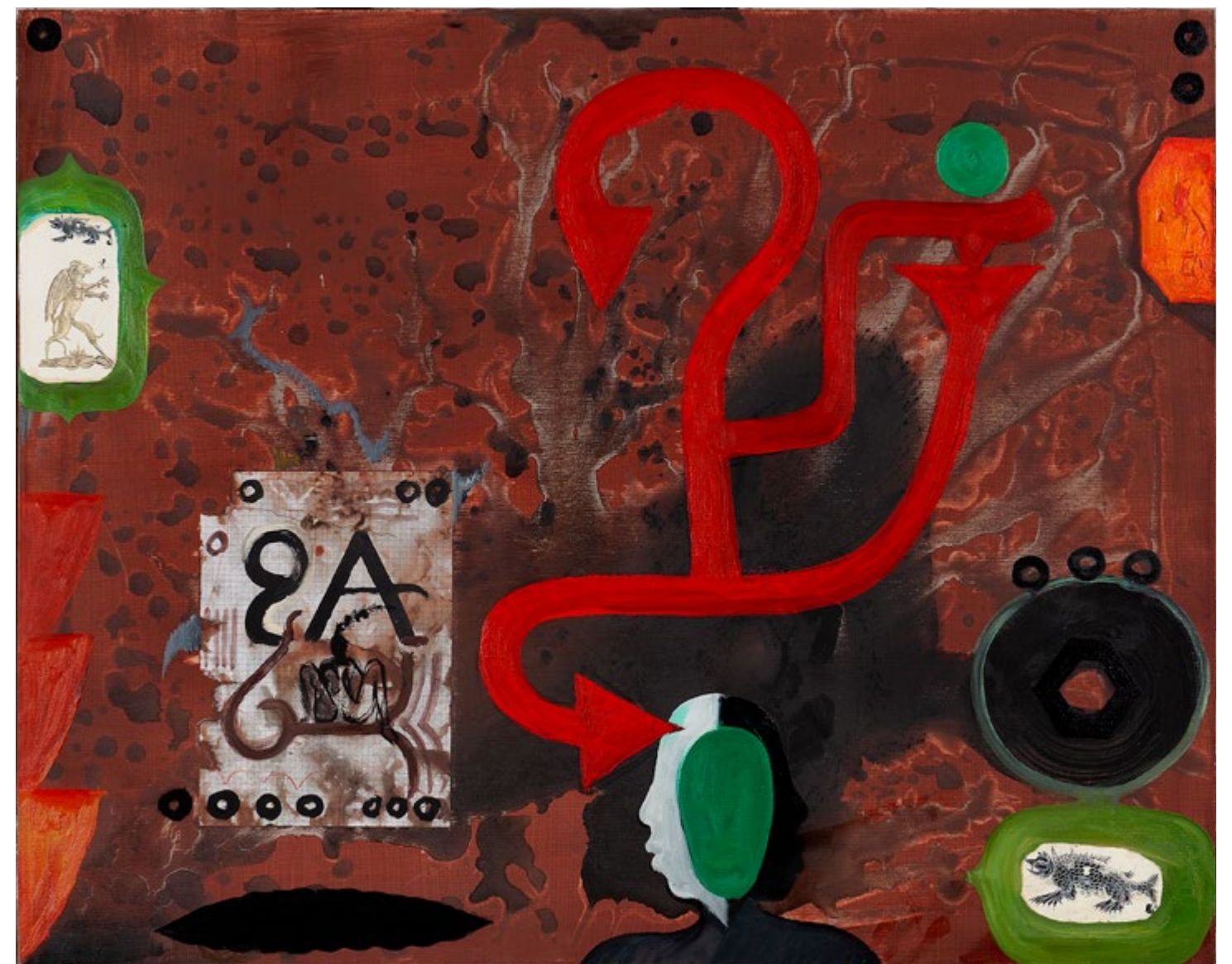
ZELENÉ VAJÍČKO, 2017, AKRYL, OLEJ, KOLÁŽ, PLÁTNO, 80X100 CM. MAJETOK AUTORA GREEN EGG, 2017, ACRYLIC, OIL, COLLAGE, CANVAS, 80X100 CM.