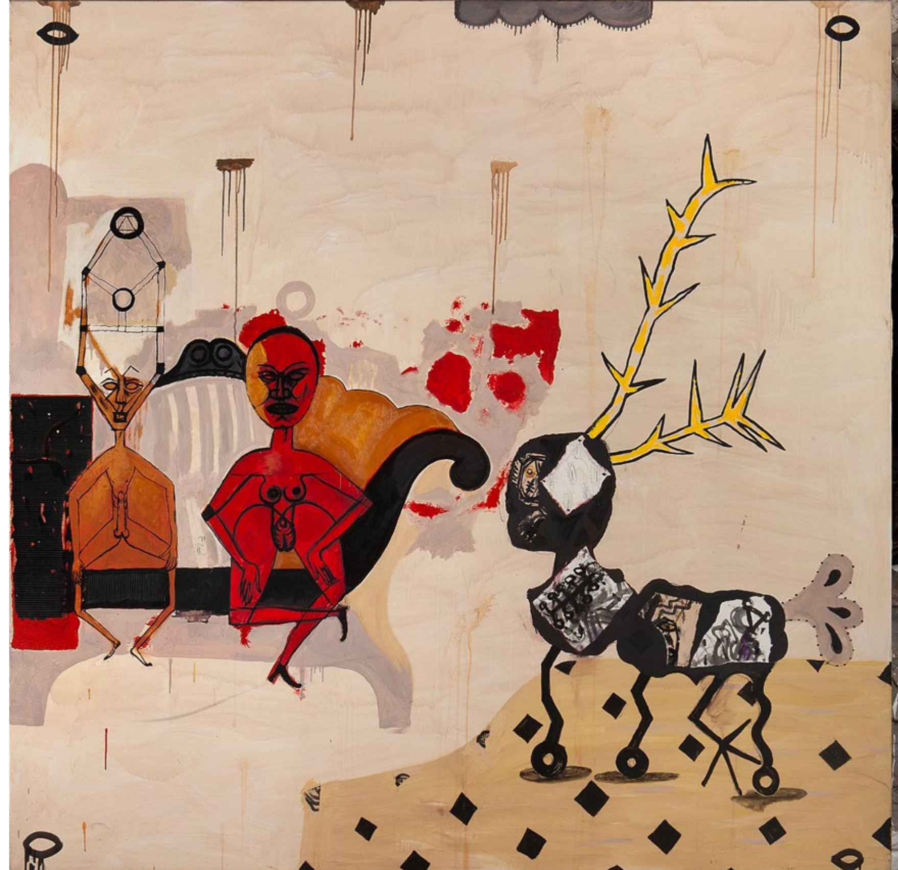
MR. AND MADAM RÉCAMIÉ S DOMÁCI M JELEŇOM, 2004, AKRYL, OLEJ, PLÁTNO, 190X200 CM. MAJETOK AUTORA MR. AND MADAM RÉCAMIÉ WITH DOMESTIC DEER, 2004, ACRYLIC, CANVAS, 190X200 CM.