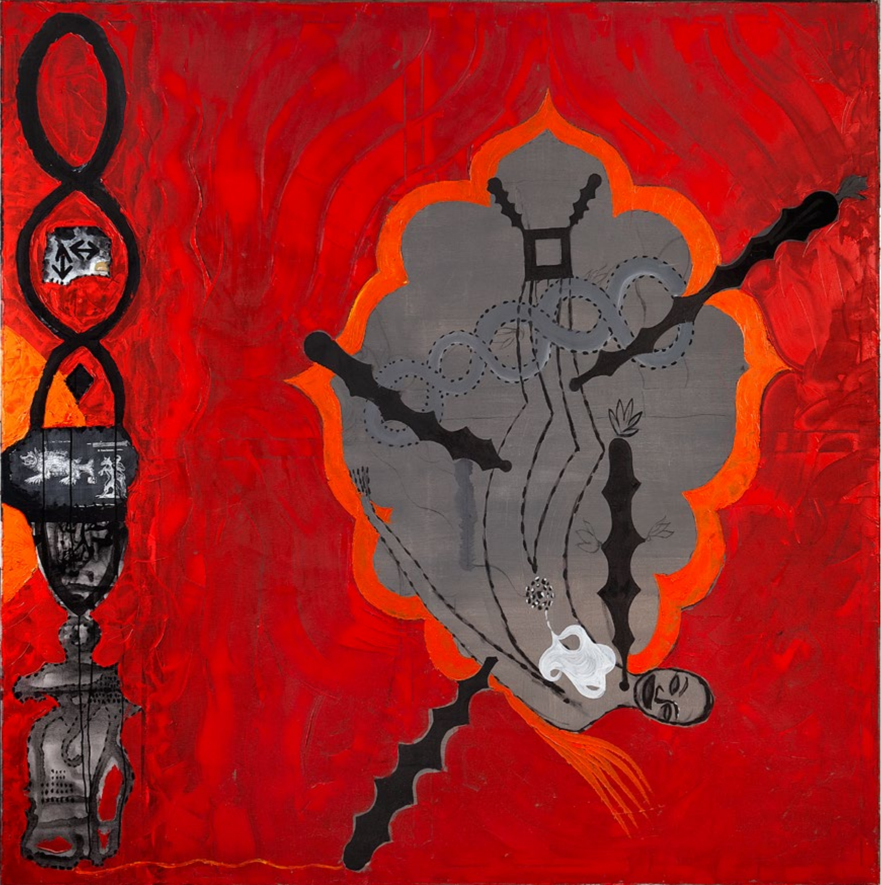
AYX, 2008, AKRYL, OLEJ, KOLÁŽ, PLÁTNO, 180X190 CM. MAJETOK AUTORA. AYX, 2008, ACRYLIC, OIL, COLLAGE, CANVAS, 180X190 CM. COURTESY OF THE ARTIST