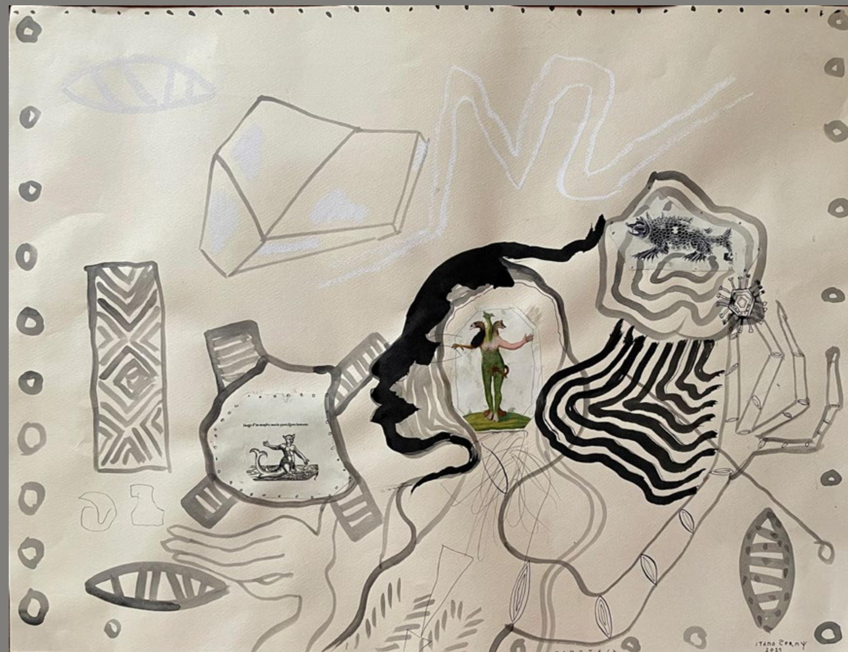
NANO, 2021, TUŠ, PASTEL, KOLÁŽ, PAPIER, 50X65 CM, MAJETOK AUTORA NANO, 2021, INK, PASTEL, COLLAGE, PAPER, 50X65 CM, COURTESY OF AUTHOR