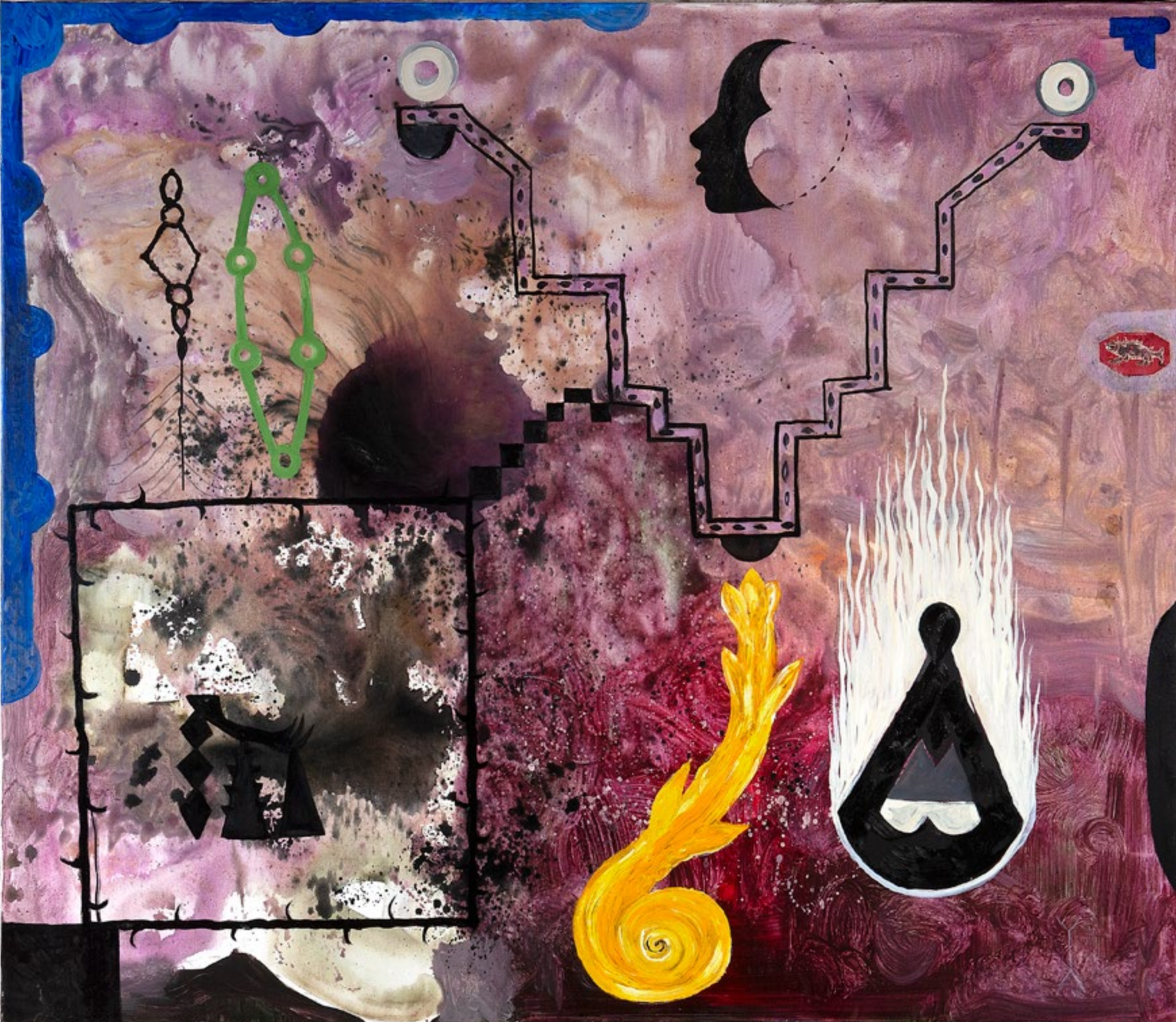
ALCHEMICKÁ KRAJINA, 2017, AKRYL, OLEJ, KOLÁŽ, PLÁTNO, 140X160 CM. MAJETOK, AUTORA ALCHEMIC LANDSCAPE, 2017, ACRYLIC, OIL, COLLAGE, CANVAS, 140X160 CM.