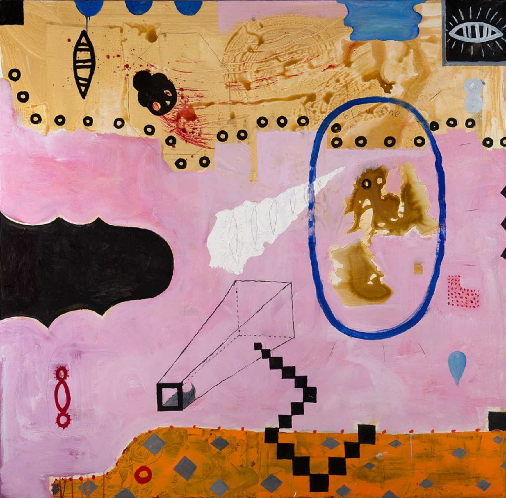
ZERO, 2017, AKRYL, OLEJ, PLÁTNO, 150X160 CM. ZERO, 2017, ACRYLIC, OIL, CANVAS, 150X160 CM.