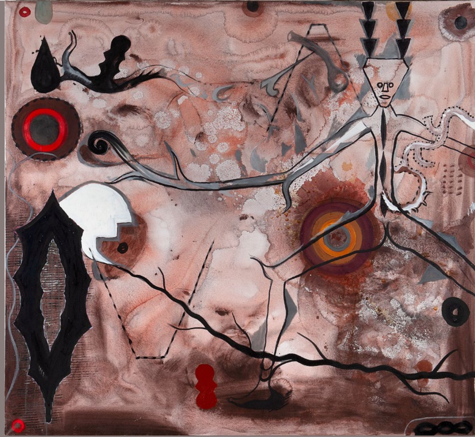
ELEMENTS, 2004, AKRYL, OLEJ, PLÁTNO, 140X160 CM. MAJETOK, AUTORA ELEMENTS, 2004, ACRYLIC, OIL, CANVAS, 140X160 CM.